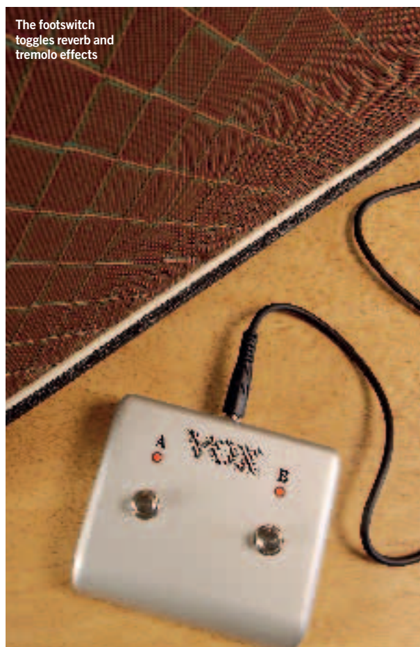
The footswitch toggles reverb and tremolo effects

Overall, it's a far cry from the somewhat stiff and unforgiving nature of a standard AC30. This is one of those amps that makes you want to dig in, hit the strings hard and really get into playing with all the nuances. Anything