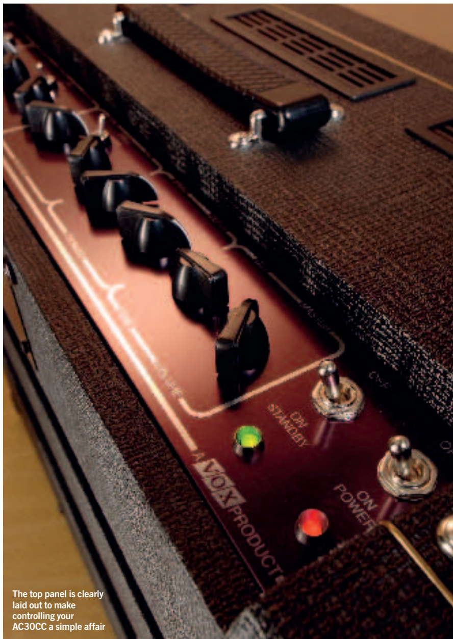
The top panel is clearly laid out to make controlling your AC30CC a simple affair

from vintage Beatles and Shads riffs to Queen and beyond is possible. The clever design means that this is an amplifier with a lot of versatility while the controls remain simple and intuitive to use.